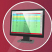
Control Room Monitor