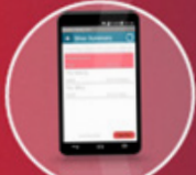
Weekly Test App